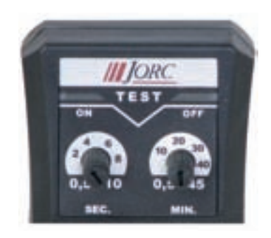
TEST-button and LED display