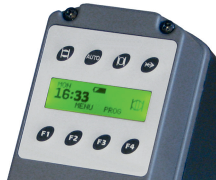
Built-in quartz controlled timer with LCD display