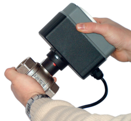
Should there be an electrical power failure, then the ball valve can be manually opened or closed.