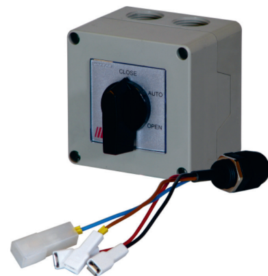
Remote control option.